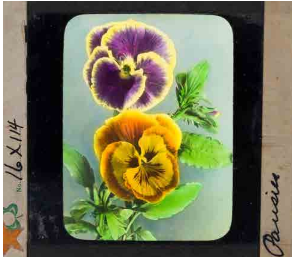
J. Horace McFarland Co., Harrisburg, Pa.