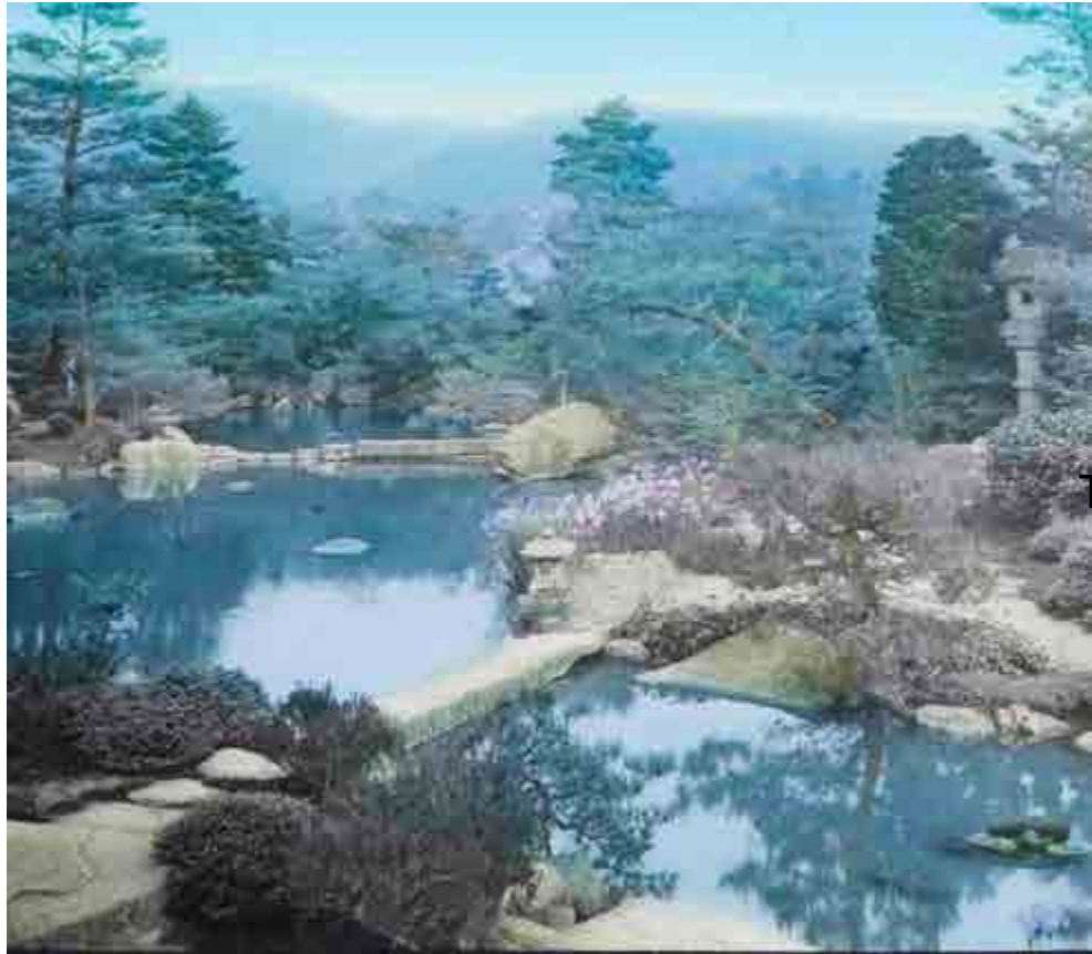
PHS T. Takagi (Photographic studio)