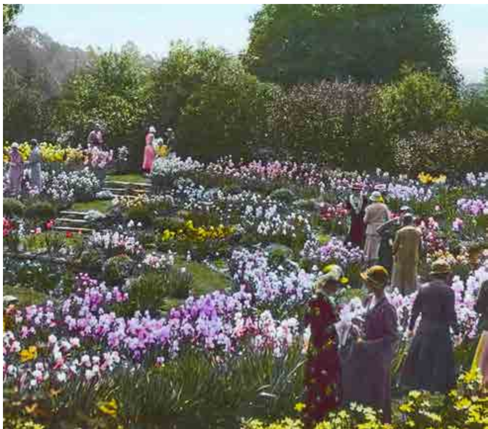
Wister Collection - Allgates, Haverford, Pa.