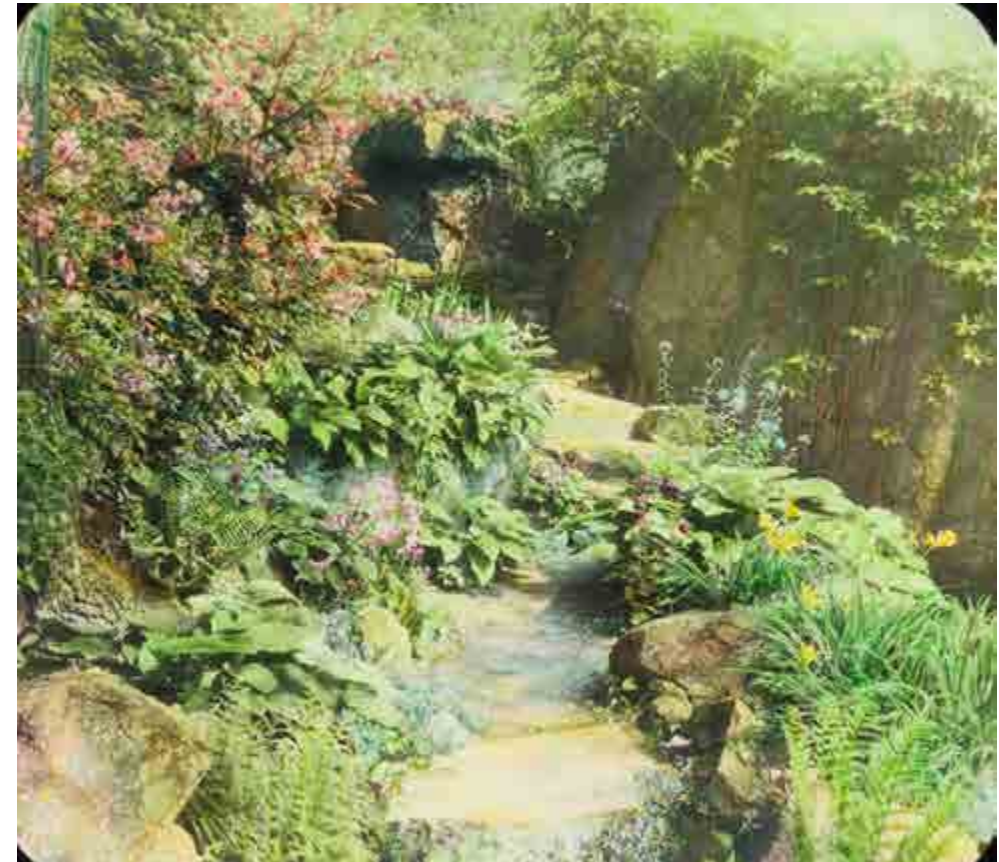
J. Horace McFarland Co.