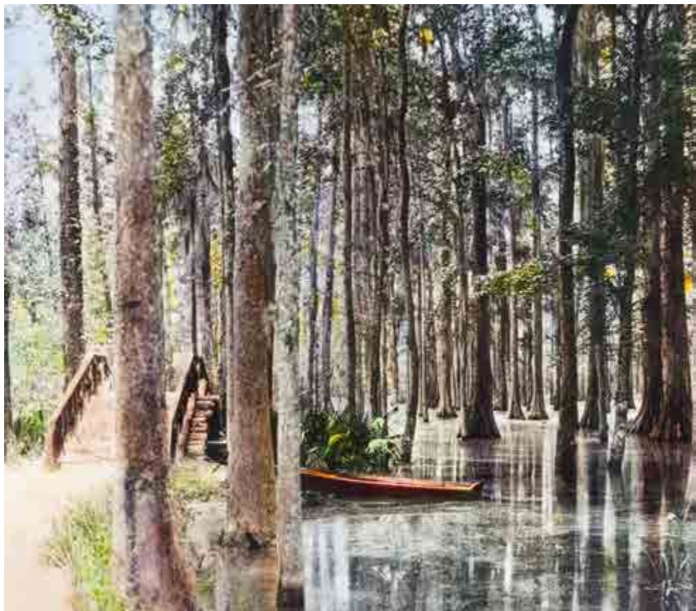
South Carolina - Cypress Gardens