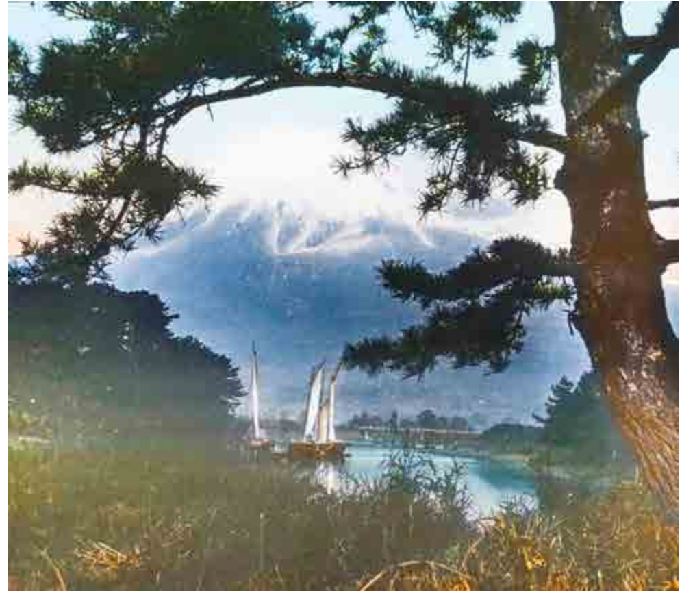
Japan - Mount Fuji