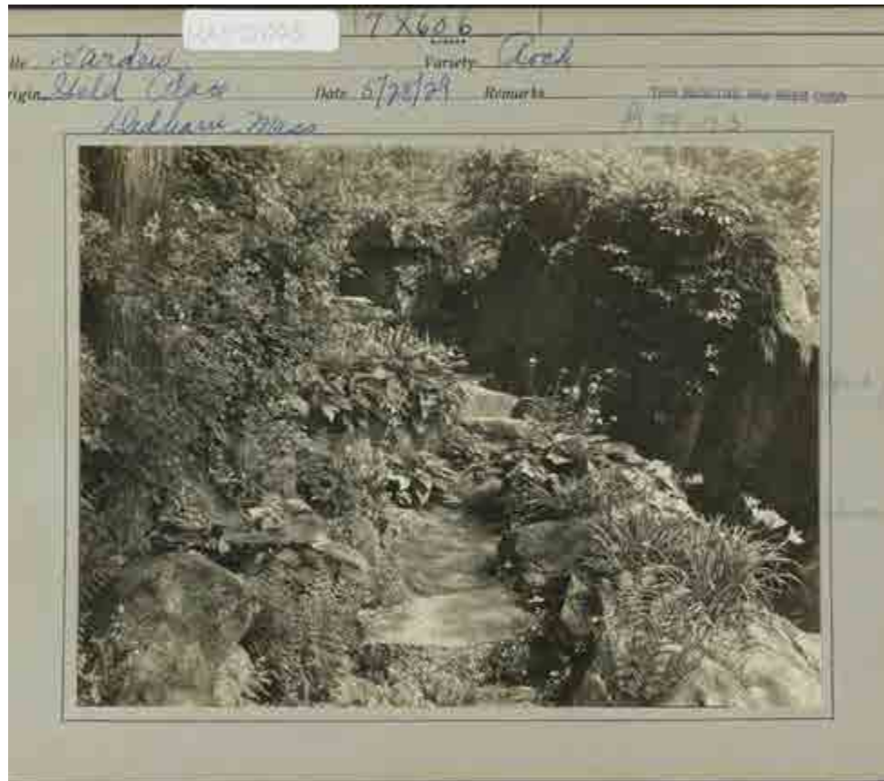
SMI Rockweld Rock Garden 1929