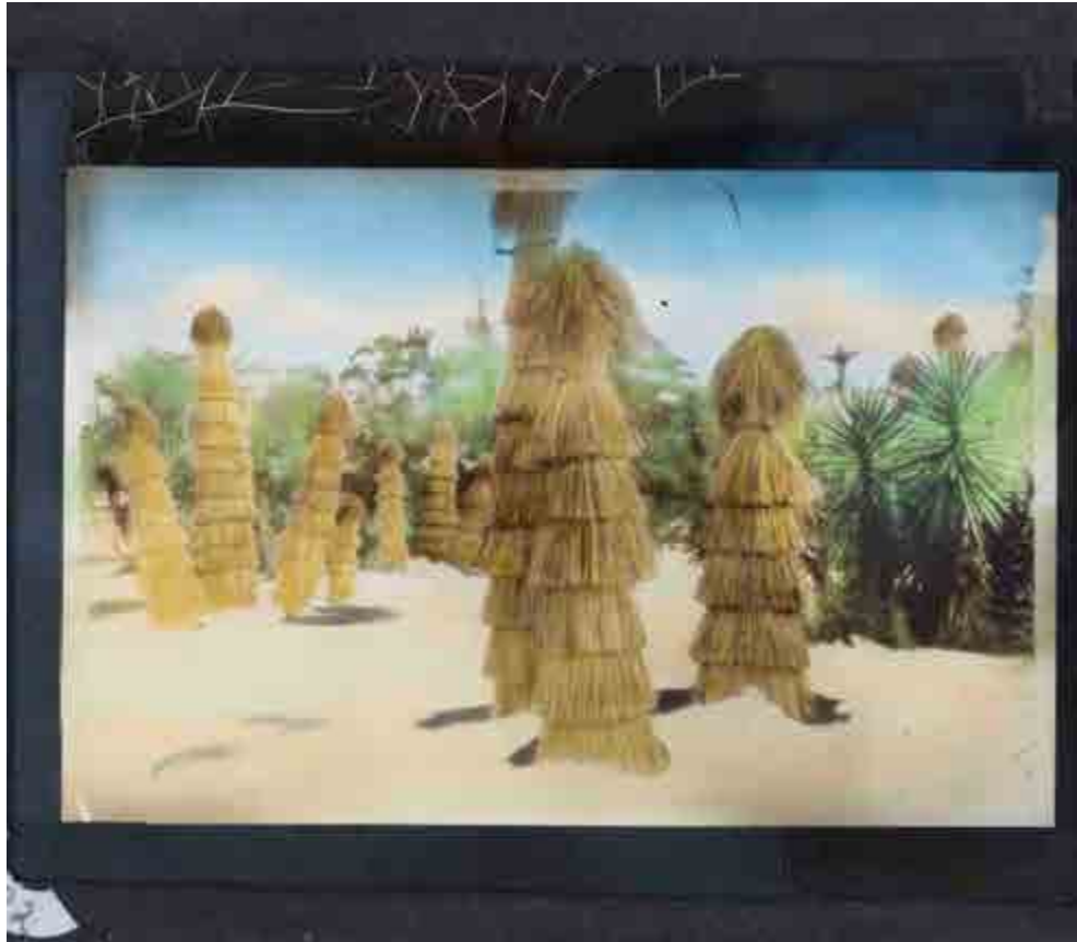
Japan - Straw Wrappings Protect Plants