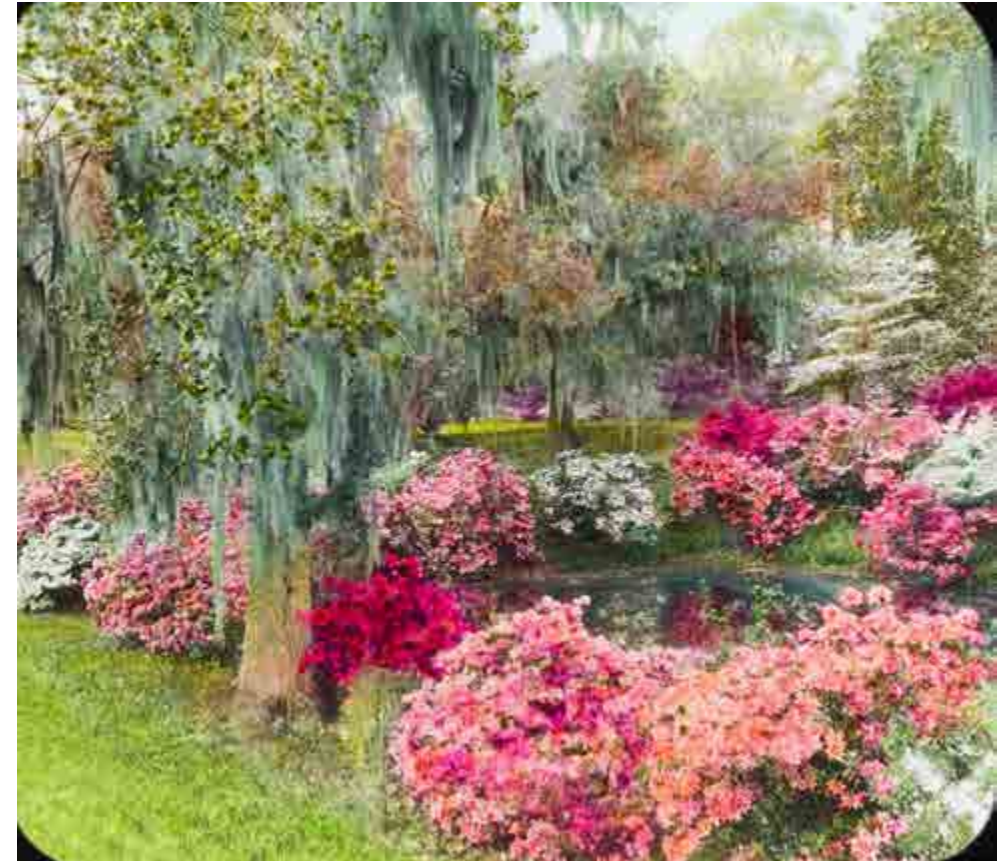
Azaleas, Middleton Place, Charleston, S.C.