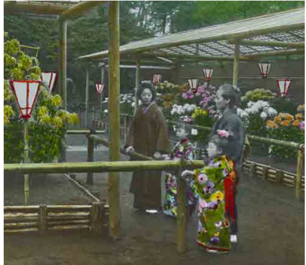
Chrysanthemum Exhibition T. Enami