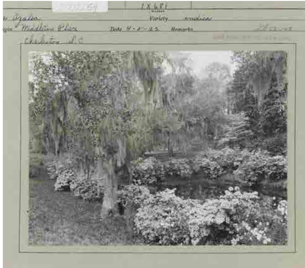
J. Horace McFarland Co. April 5, 1922