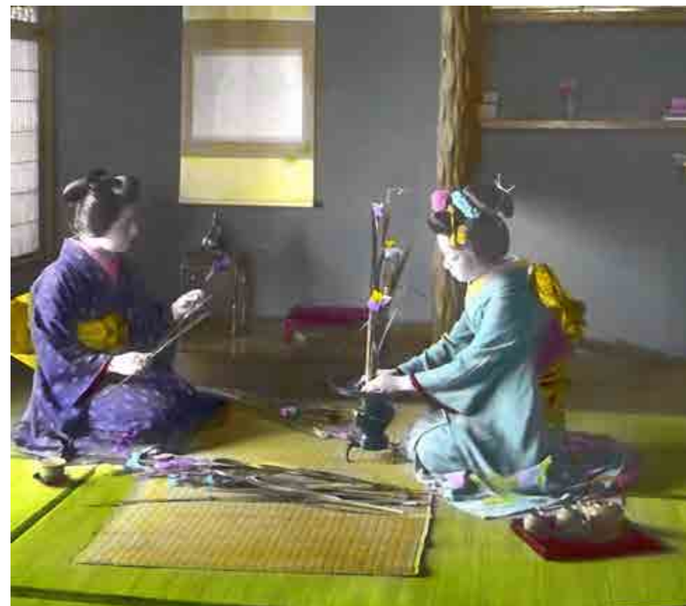
Swarthmore Futaba (Photographic studio)