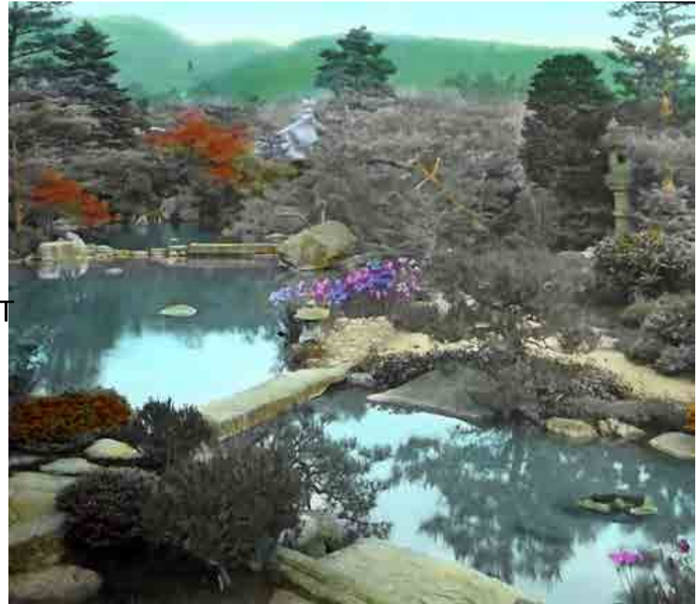
Swarthmore Futaba (Photographic studio)