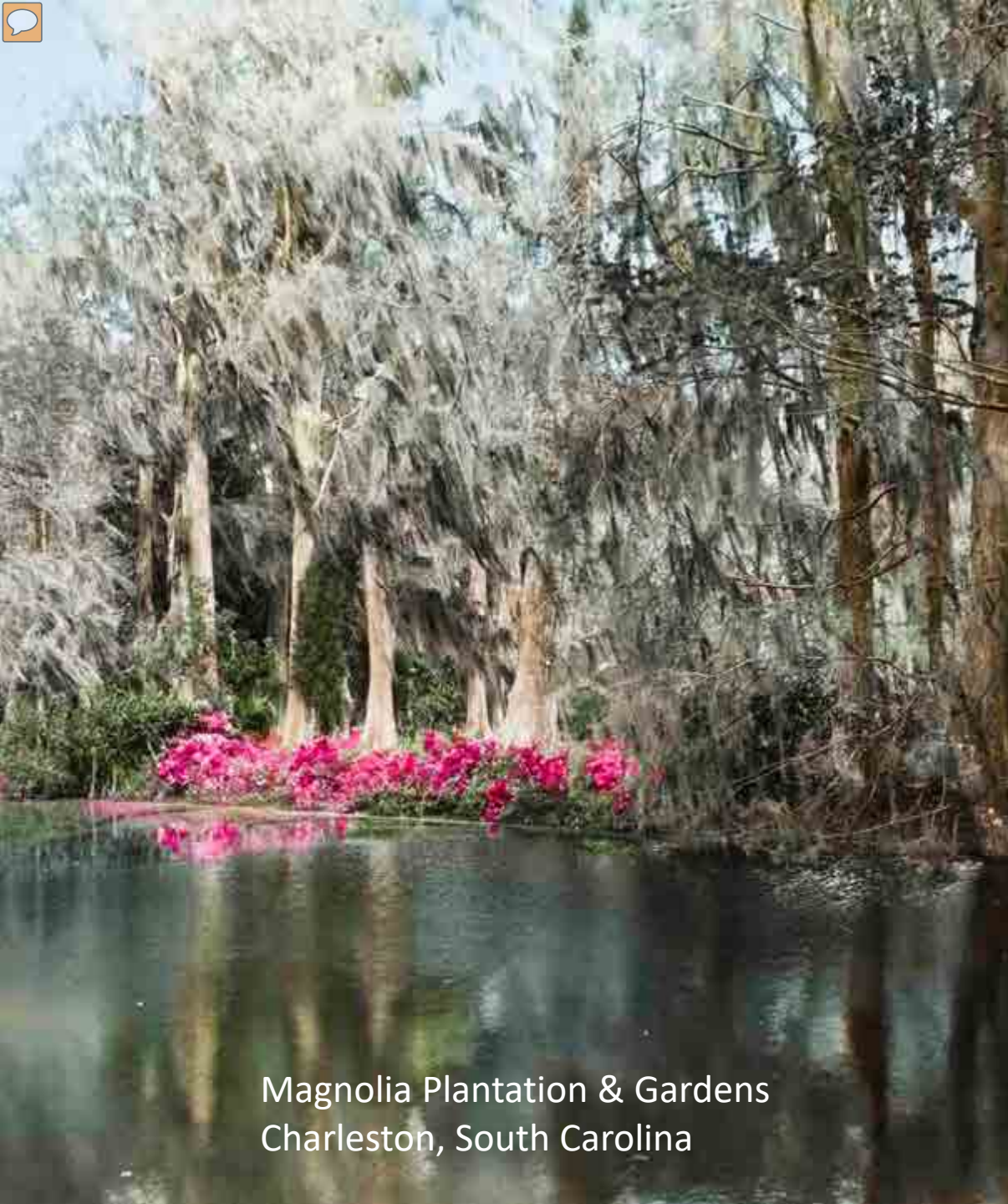
Magnolia Plantation & Gardens Charleston, South Carolina