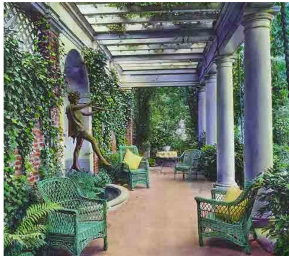
Garden Club of Philadelphia - Laverock Hill, Pa.