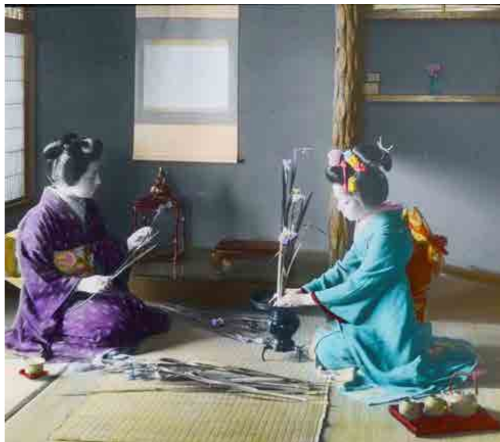
PHS T. Takagi (Photographic studio)