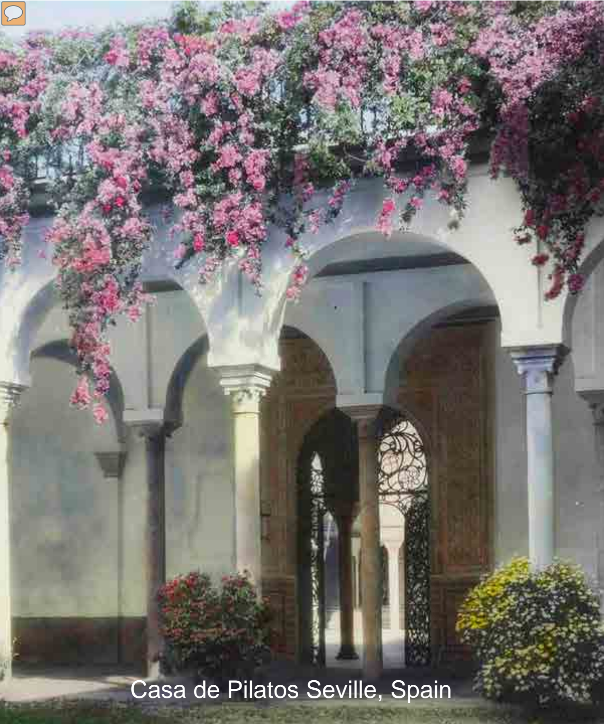
Casa de Pilatos Seville, Spain