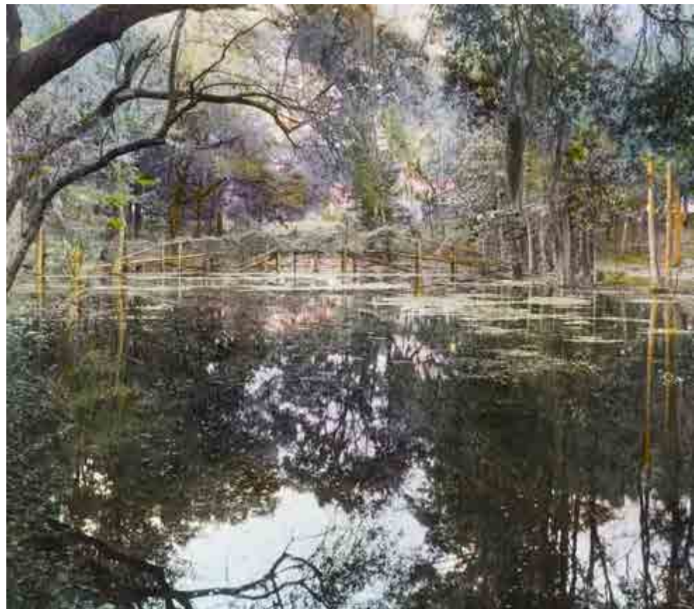
South Carolina - Cypress Gardens