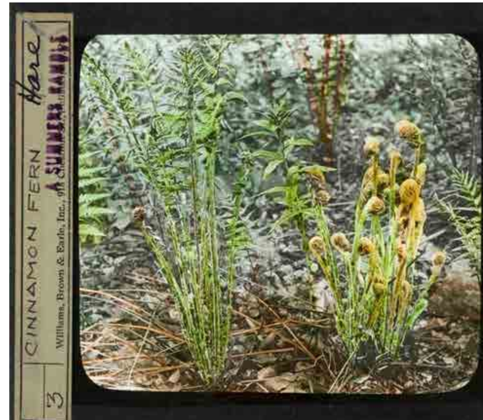
Cinnamon Fern - Hare