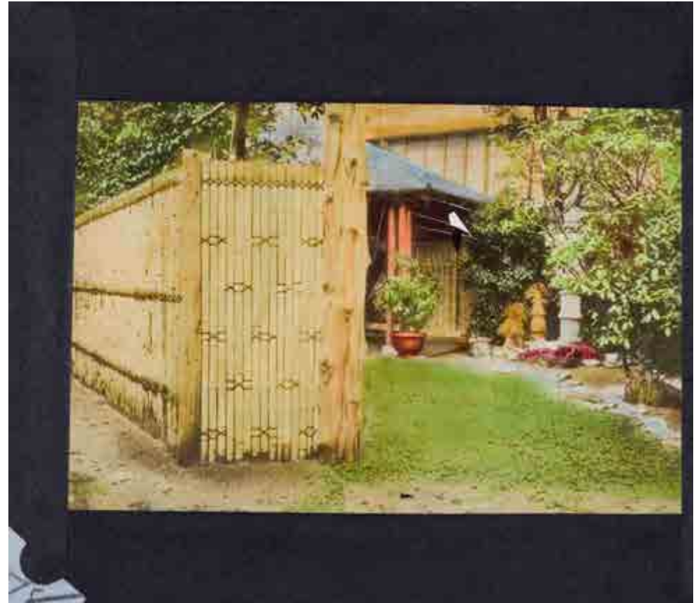
Japan - Japanese Fence and Garden